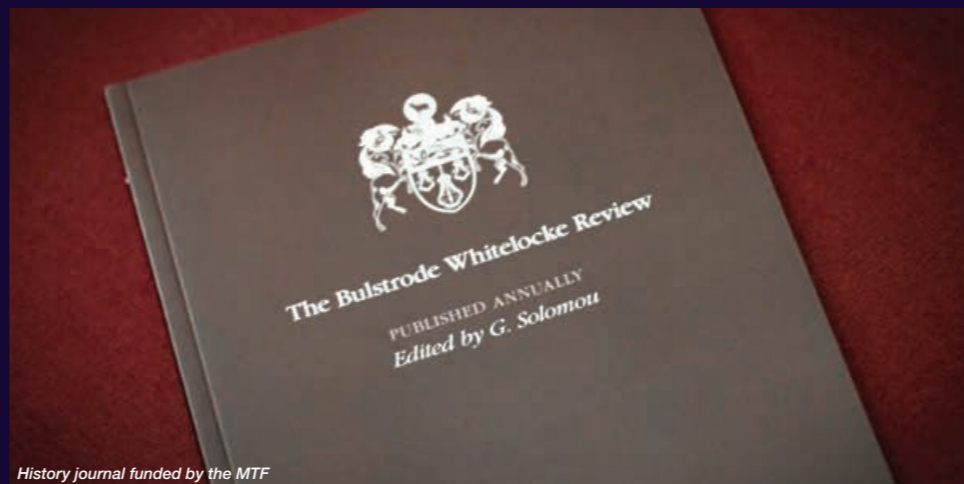
History journal funded by the MTF