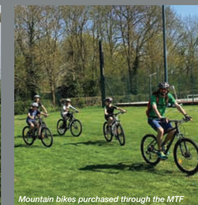
Mountain bikes purchased through the MTF