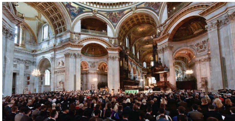
Triennial Service filmed in Ultra HD with Studio 72 equipment funded by the MTF

Many companies operate a scheme in which they will match the philanthropic gifts made by their employees and we encourage you to investigate this. For a list of companies we are aware of that match charitable giving, please visit http://development.mtsn.org.uk/file/company-matched-giving.pdf .