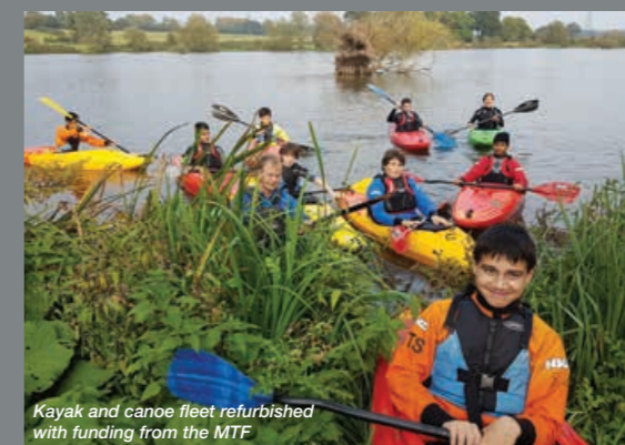
Kayak and canoe fleet refurbished with funding from the MTF